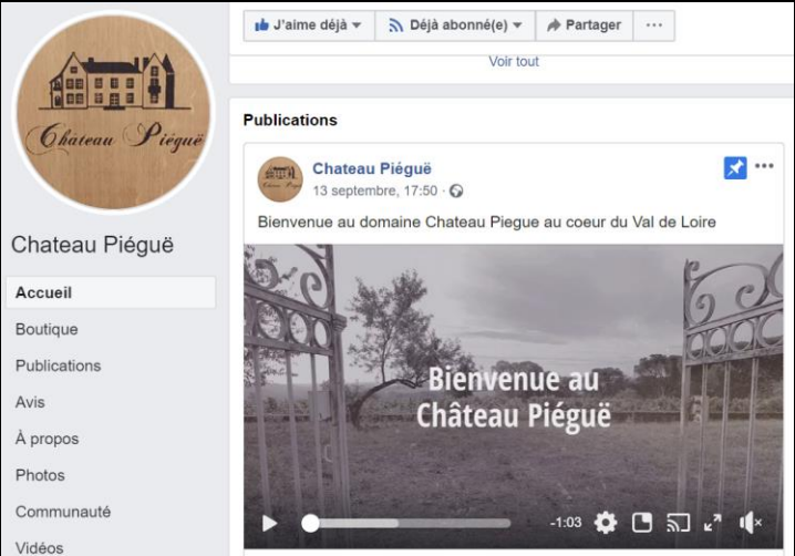
Example of an achievement for a winery in Loire region (France) (communication video support for social networks)